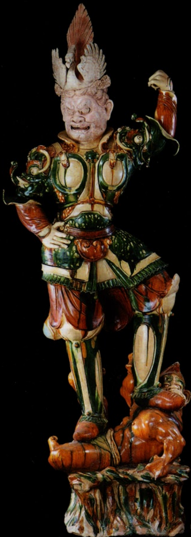
Height 4' 8"