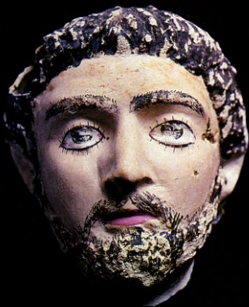
ROMANO-EGYPTIAN PLASTER FUNERARY MASK DATED A.D. 100-200