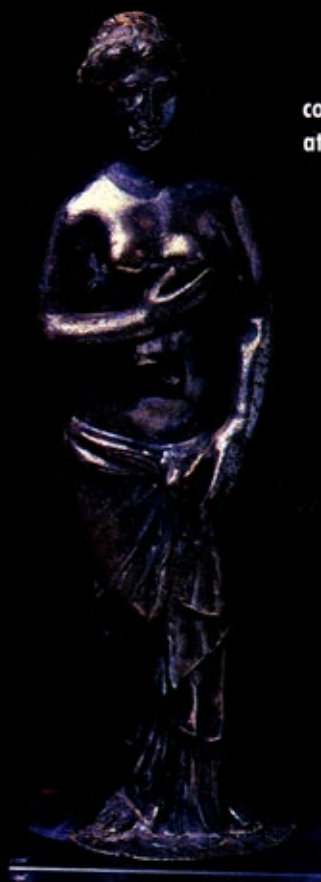
ROMAN SILVER SCULPTURE OF THE GODDESS APHRODITE DATED A.D. 100-300 FOUND IN SYRIA

"He is a surprisingly contemporary citizen. We gaze at the face and think, 'I know that man, I've seen him somewhere...'"