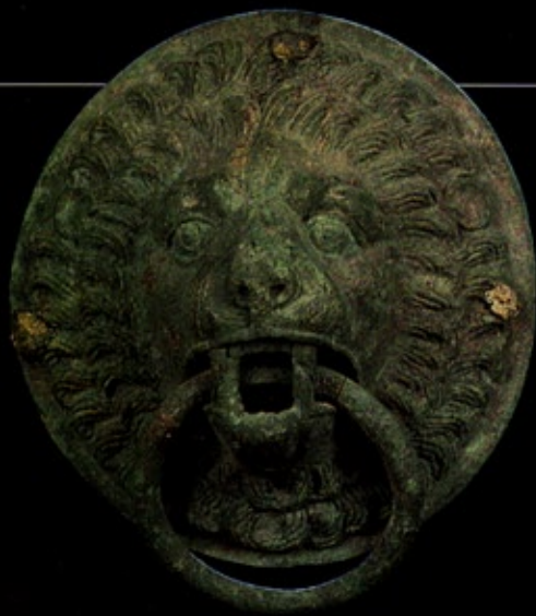
ROMAN BRONZE HANDLES IN THE SHAPE OF LION HEADS DATED A.D. 100-300

"These were probably attached to a great wooden chest. We can only guess what treasure it might have contained that it required such ferocious guardians."